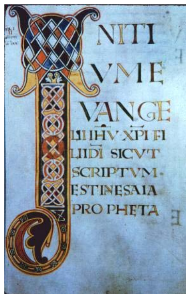
Above: Incipit from the Evangelary of Saint Mary and the Martyrs, Trier: Mark Incipit. 9th c. A.D. (Trier: Stadt. Bibl Cod. 231 f. 6). 17

(a) Navigational tools: Stallybrass identifies a number of navigational aids that were developed as early as the 13th-century to deal with increasingly larger numbers of books. 18 These navigational tools include concordances to help find particular phrases or passages in the Bible, the introduction of subject indexes and library catalogues, the use of alphabetization to organize indexes (as opposed to topical or hierarchical indexes), the introduction of tables of contents and page numbering, the use of tabs and